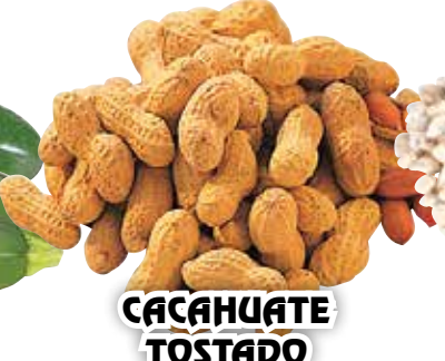
CACAHUATE TOSTADO Toasted Peanuts