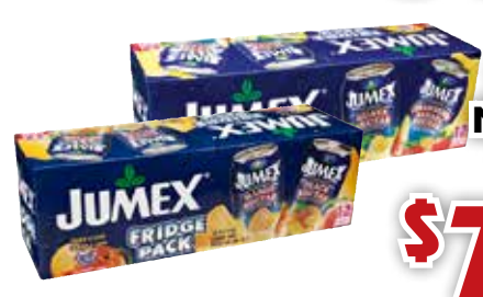
JUMEX NECTAR 12 Pack