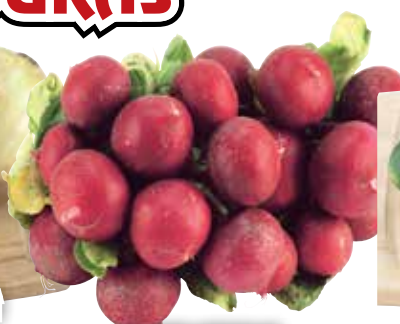
RABANOS Radish Bunches