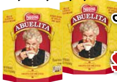
CHOCOLATE ABUELITA 19 Oz.