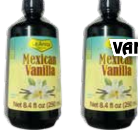
LA ANITA VANILLA EXTRACT 8.4 Oz.