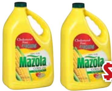
MAZOLA CORN OIL 96 Oz.