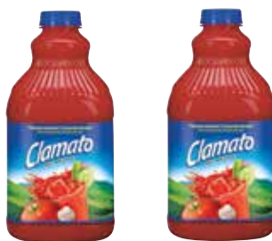
CLAMATO 64 Oz.