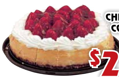
CHEESECAKE CON FRUTA