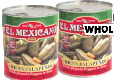
EL MEXICANO WHOLE JALAPEÑOS 26 Oz.