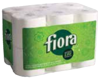
FIORA BATH TISSUE 12 Pack