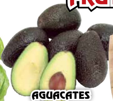
AGUACATES Avocados, 2 Lb. Bag