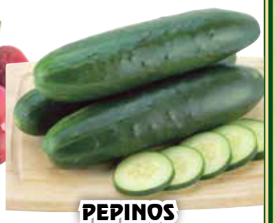
PEPINOS GRANDE Extra Large Cucumbers