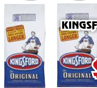
KINGSFORD ORIGINAL CHARCOAL 16 Lb.