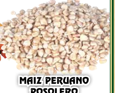
MAIZ PERUANO POSOLERO Peruvian Posole Corn