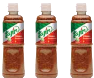
TAJIN REGULAR 14 Oz.