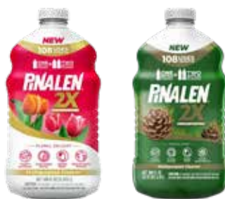
PINALEN CLEANER 108 Oz.