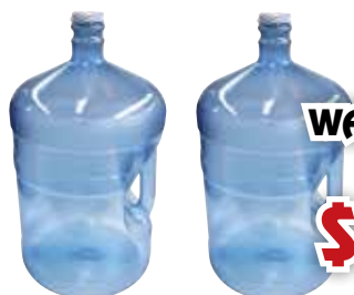
5 GALLON WATER BOTTLE