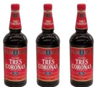
TRES CORONAS JEREZ 1 Liter