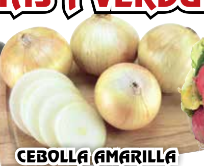
CEBOLLA AMARILLA GRANDE Jumbo Yellow Onions