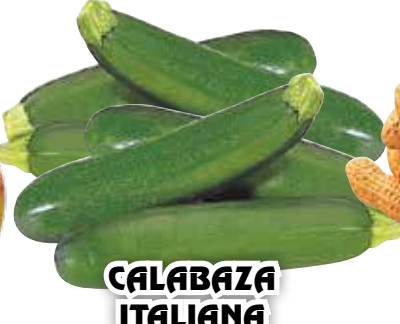
CALABAZA ITALIANA Italian Squash