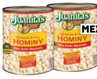
JUANITA'S MEXICAN HOMINY 108 Oz.