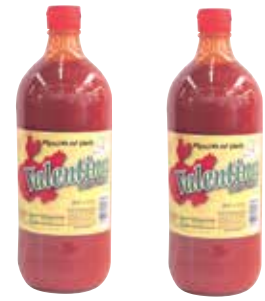
VALENTINA HOT SAUCE 34 Oz.