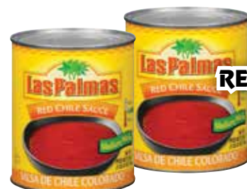
LAS PALMAS RED CHILI SAUCE 28 Oz.