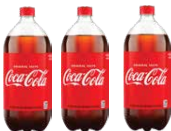
COCA-COLA MEXICANA 3 Liter